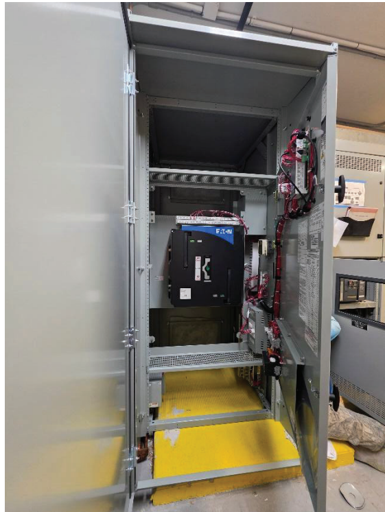
Figures 5 & 6: New 2500A ATS Delivered and Placed on Painted Equipment Pad