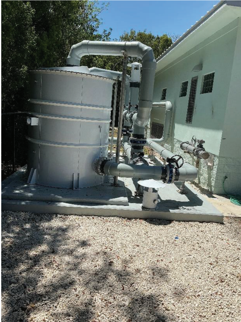
Figure 9: Site Restoration & #57 Stone Installed at Vacuum Station G