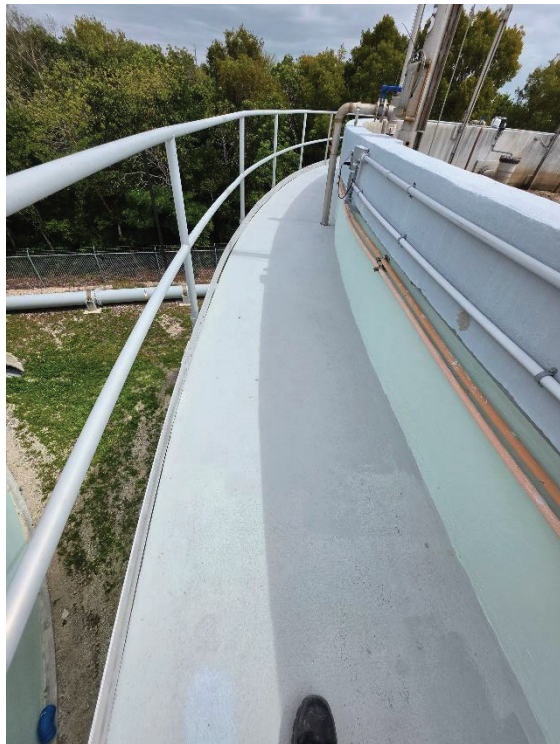
Figures 3 & 4: Pedro Falcon Using Tnemec Series 157 Top Coating on the SBR and Building Walkways