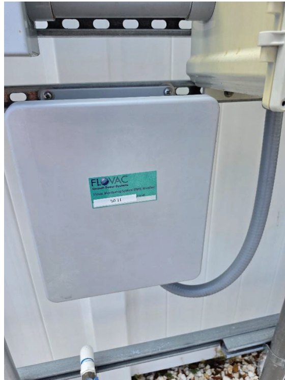
Figures 1 & 2: Flovac Lift Station Monitoring at Keys Holding