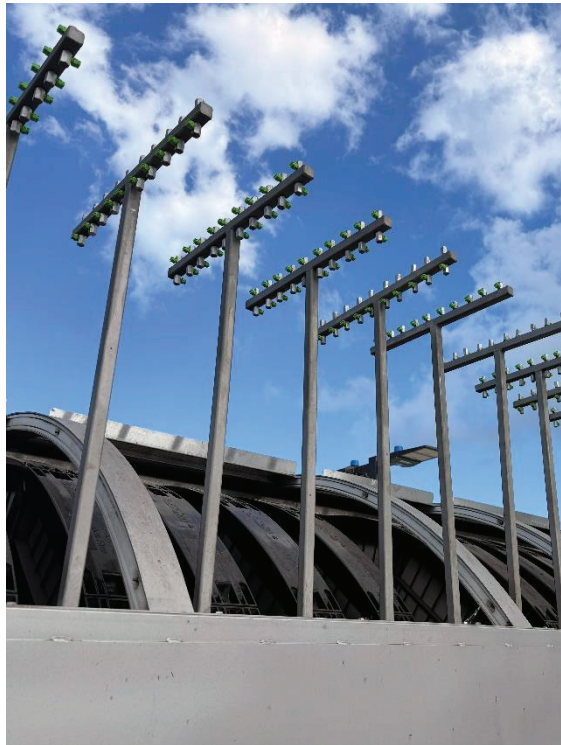
Figures 7 & 8: Evoqua Tech on Site Installing Plastic Sprayer Nozzles on Spray Bars