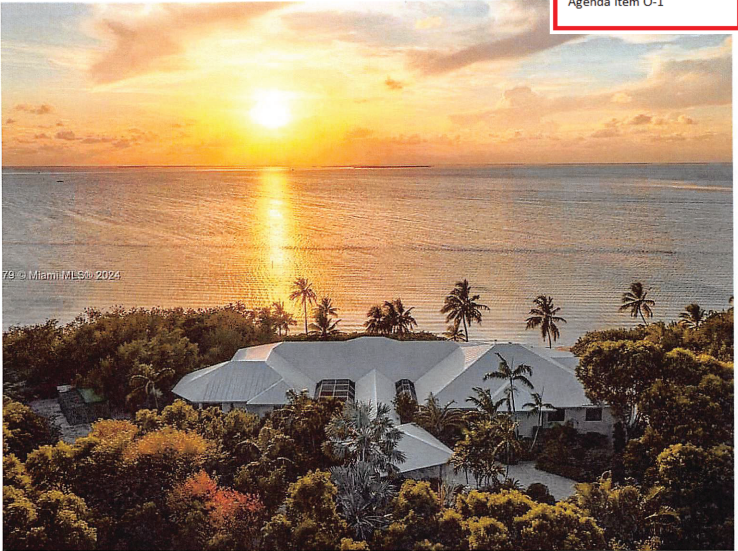
Example House A