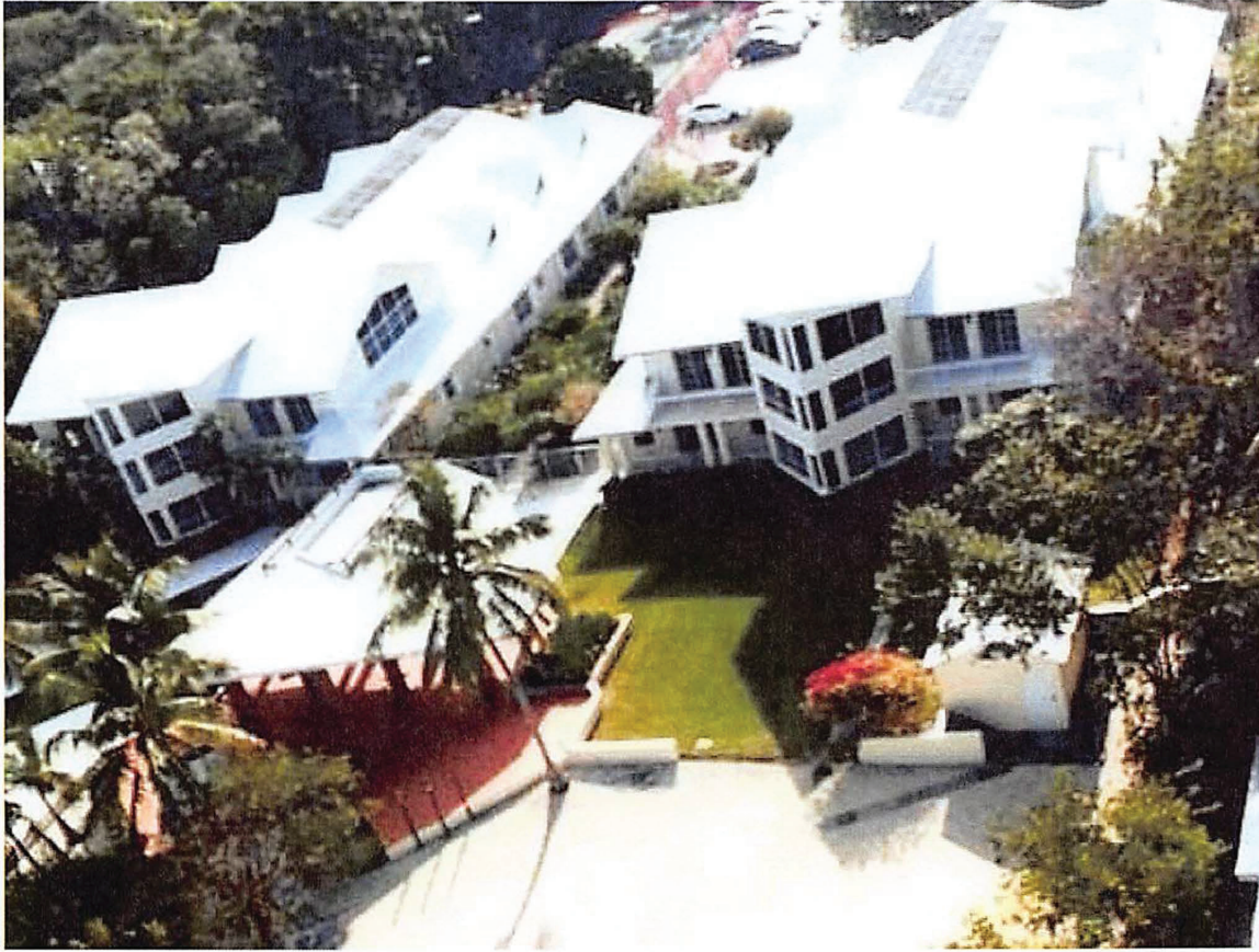
Example House B