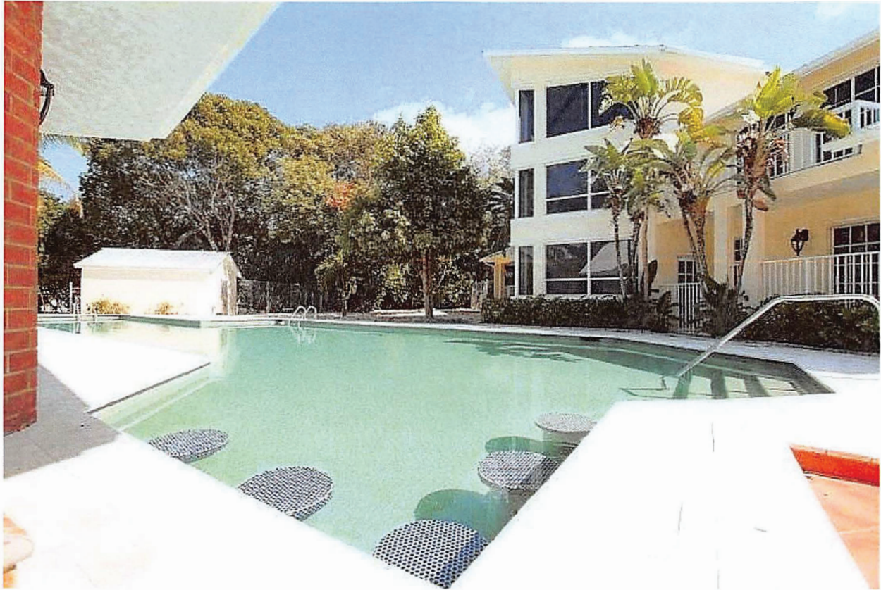
Example House B