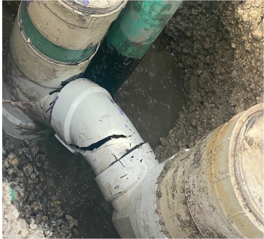
1502 Shaw Dr. Broken clean out repair