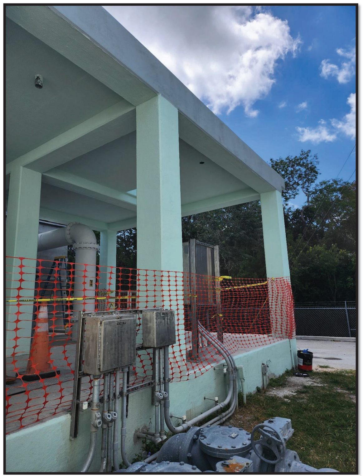
Figure 2: Filter Platform Side View