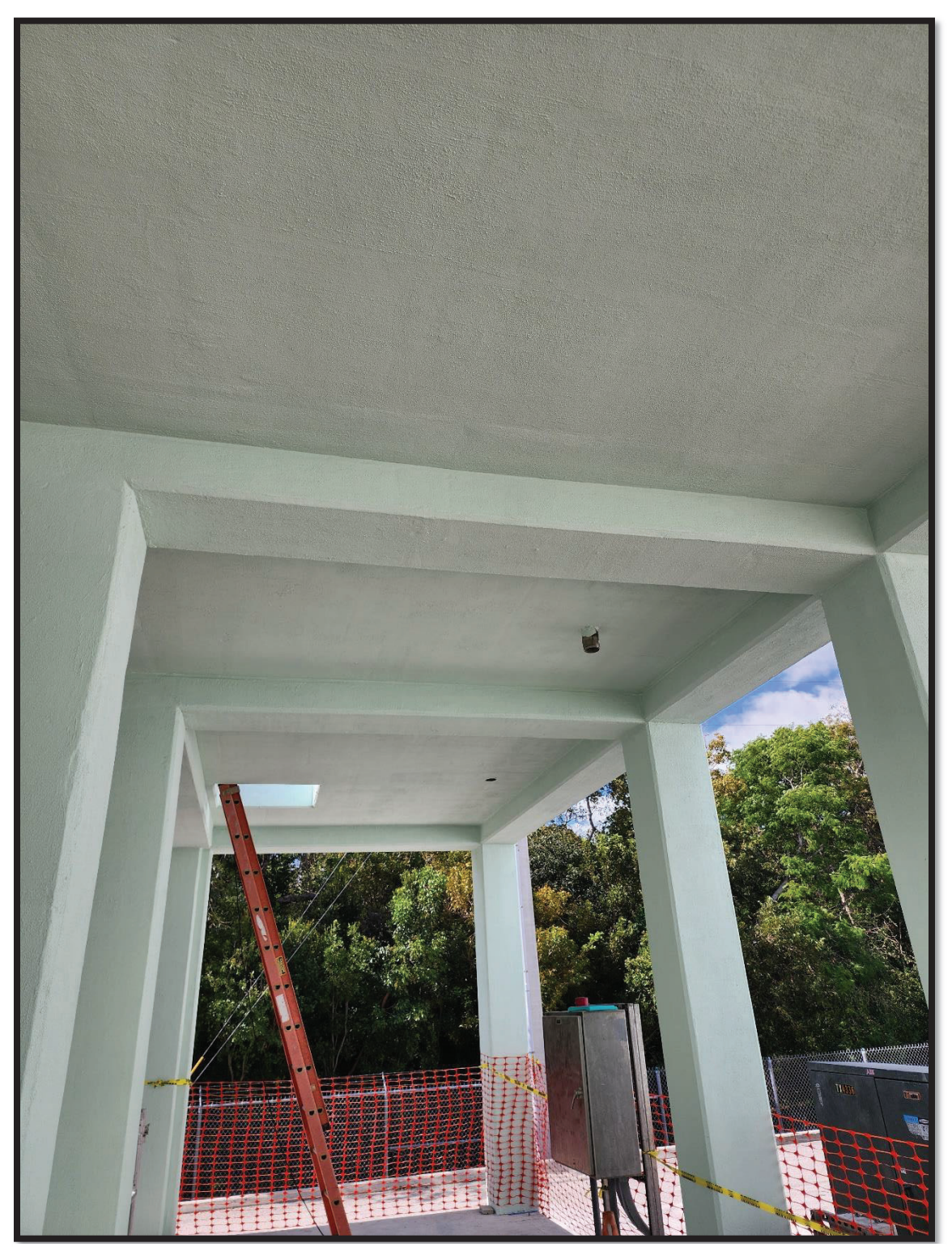
Figure 3: Filter Platform Bottom View