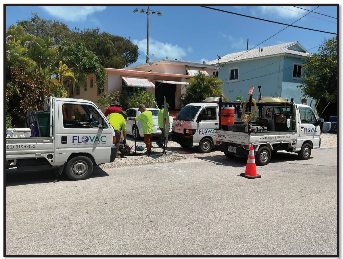
Figure 1: Flovac crew preparing to install monitoring system in a KLWTD vacuum pit